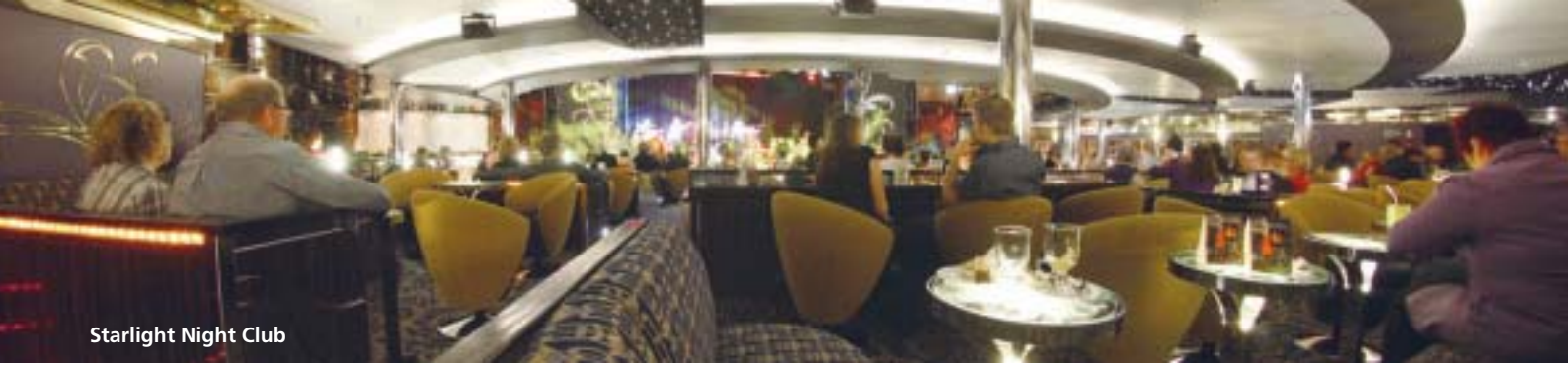
Starlight Night Club

The Baltic Princess is nearly identical to the ms Galaxy delivered in 2006. She can carry 2,800 passengers, of which 2,500 can be accommodated in 927 passenger cabins. While small, the cabins, pre-fabricated by Piikkio Works, are adequate for an overnight cruise. There are several restaurants and public rooms, ranging from a buffet restaurant to the grill Restaurant, Russian restaurant and gourmet Restaurant. Entertainment areas include a large, two-deck show lounge and nightclub called the Starlight, a disco, a dance bar and two pubs, among others. Below the car deck, there are a swimming pool and saunas.